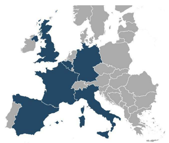
Figure 1.1 Scope of the project: IndustRE target countries

This document stems from work carried out in previous tasks of Work Package 2 of the IndustRE project, presented in the following working documents: the preliminary definition of the business models (T2.1), see (Papapetrou 2015), the screening of the regulatory and market frameworks of the target countries (T2.2), see (Vallés, Frías, and Gómez 2015), the stakeholder consultation process (T2.3), see (Jezdinsky and Nuño 2016) and Business models and market barriers (T2.4), see (Vallés, Gómez, and Frías 2016).